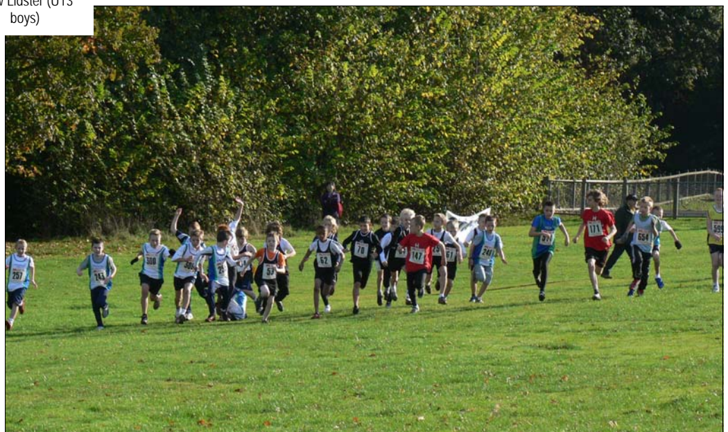
Mayhem at the start of the U11 boys' race. They hit the crest and turn faster than the seniors! RHAC half the field! Top class.