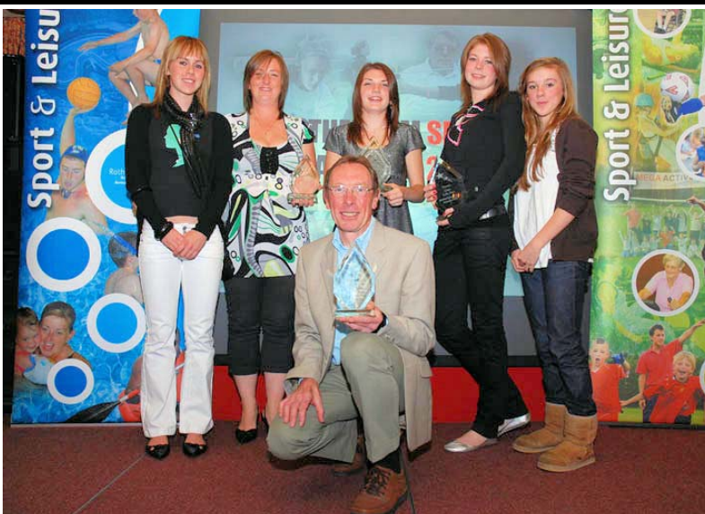
Rotherham Sports Awards Thursday 25th October

Parents of non club members will be asked to sign a consent form prior to their child taking part in the sessions