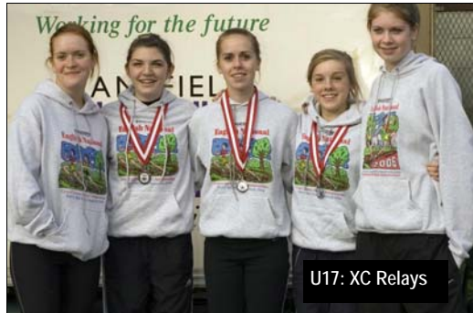
U17: XC Relays

Thanks to all club runners for supporting this event.