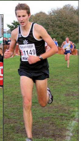
Top RHAC supporters in action: