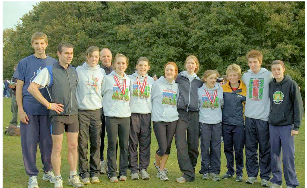
Members of Rotherham cross-country relay teams at the National, Berry Hill, Mansfield, 4th November 2006

Rotherham Harriers & AC November 2006 Ser 4 No 29