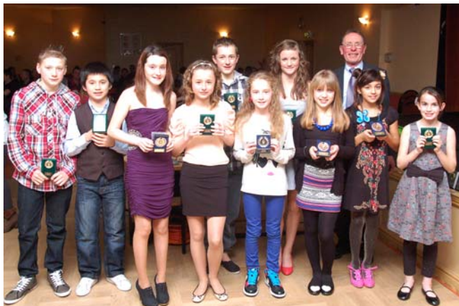
Above: Maurice Jackson Awards Below: Cross-country awards winners