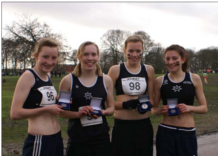
Members of RHAC under-17 team (above) and U13 team on the left