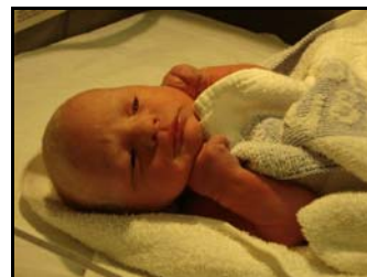
Received the following email: