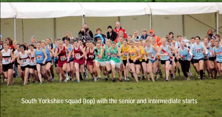
South Yorkshire squad (top) with the senior and intermediate starts

National Colleges Championships, Loughborough