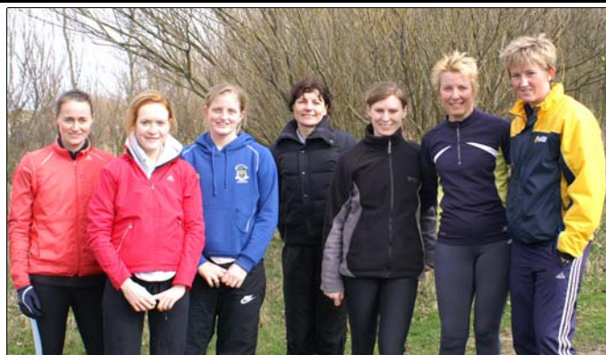
RH Ladies' Squad at Sunderland for the Nprthern 6-stage

On the day the women's team finished 9th, and the men's team 23rd. This is the best result I can remember for the RH ladies, and the 5th consecutive year that the men's team have qualified for the national event. Thanks to all the runners & supporters who turned out on the day